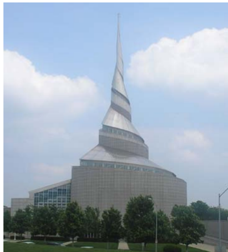
Join us in beautiful, historic Independence, Missouri